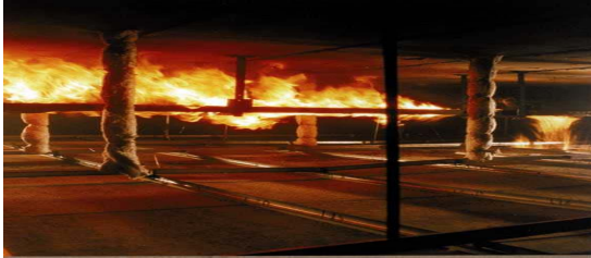
Excessive fire contribution of exposed polyolefin cables in a real scale plenum fire test.

It is important to note the dramatic improvement SMOKEGUARD® FP provides in the fuel load that cables can contribute in an evolving fire. Limited Combustible Cables using SMOKEGUARD® FP achieve up to 5 times reduction in fuel load over the current European conventional fire performance levels and up to 3 times better than NFPA 262 plenum cable standards.